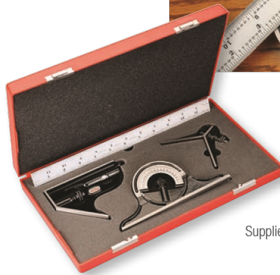
Supplied in protective case