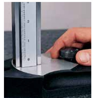
Precise positioning with fine-adjustment knob on the base isolates column and slide from external pressures