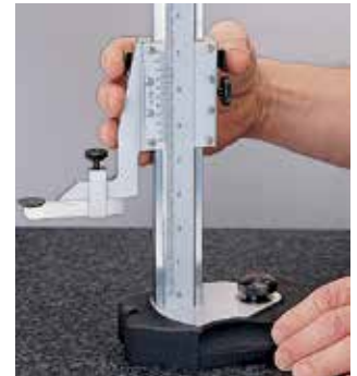
Quick-adjusting screw release allows rapid slide movement to desired area, then precisely position with the fine adjustment knob

Hardened bars on all sizes through 24" and 600mm Furnished with Auxiliary Straight Carbide Scriber. Shown with optional Auxiliary Circular Carbide Scriber.