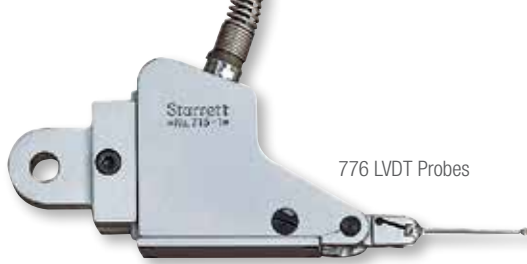
776 LVDT Probes