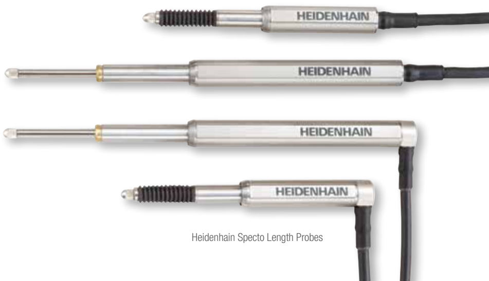
Heidenhain Specto Length Probes